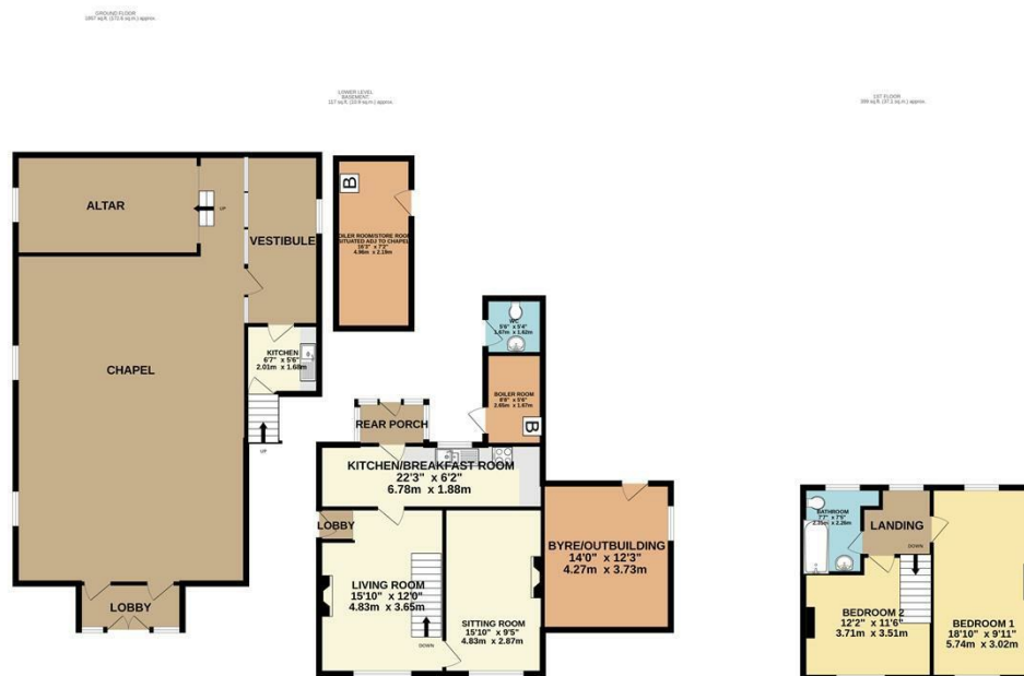
CHAPEL COTTAGE AND BORROWBY CHAPEL BORROWBY, THIRSK .Y07 4QL

TOTAL FLOOR AREA : 2374 sq.ft. (220.5 sq.m.) approx.